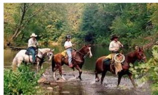
Clubs and Camps