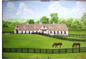
Farm / Ranch/Estates