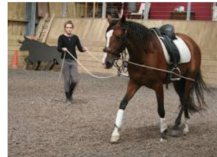
Trainers Professional Liability