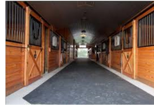
Boarding and Stables