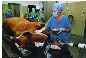
Equine Mortality And Major Medical