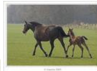
Pleasure/ Show And Hobby